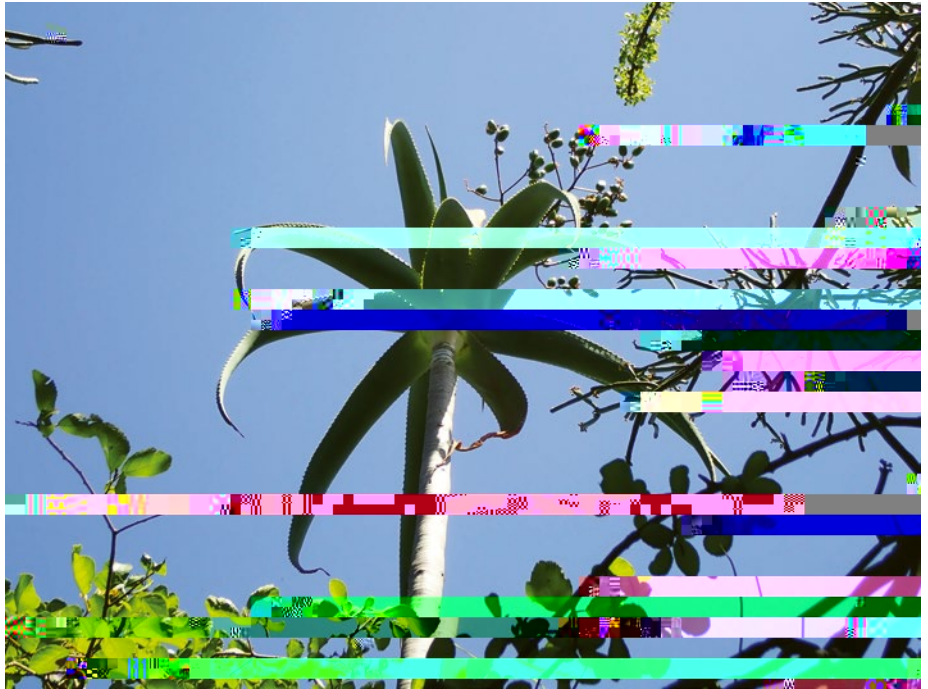
Aloe elata VU B2ab(iii)