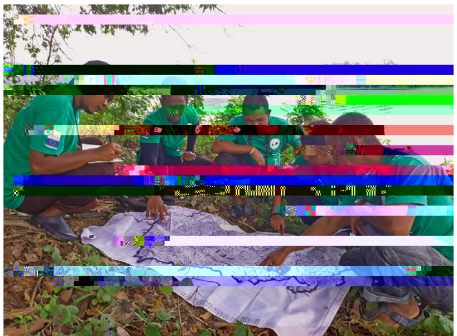
Mala n ian Na e S cie h n bill g a dian in aci n y y