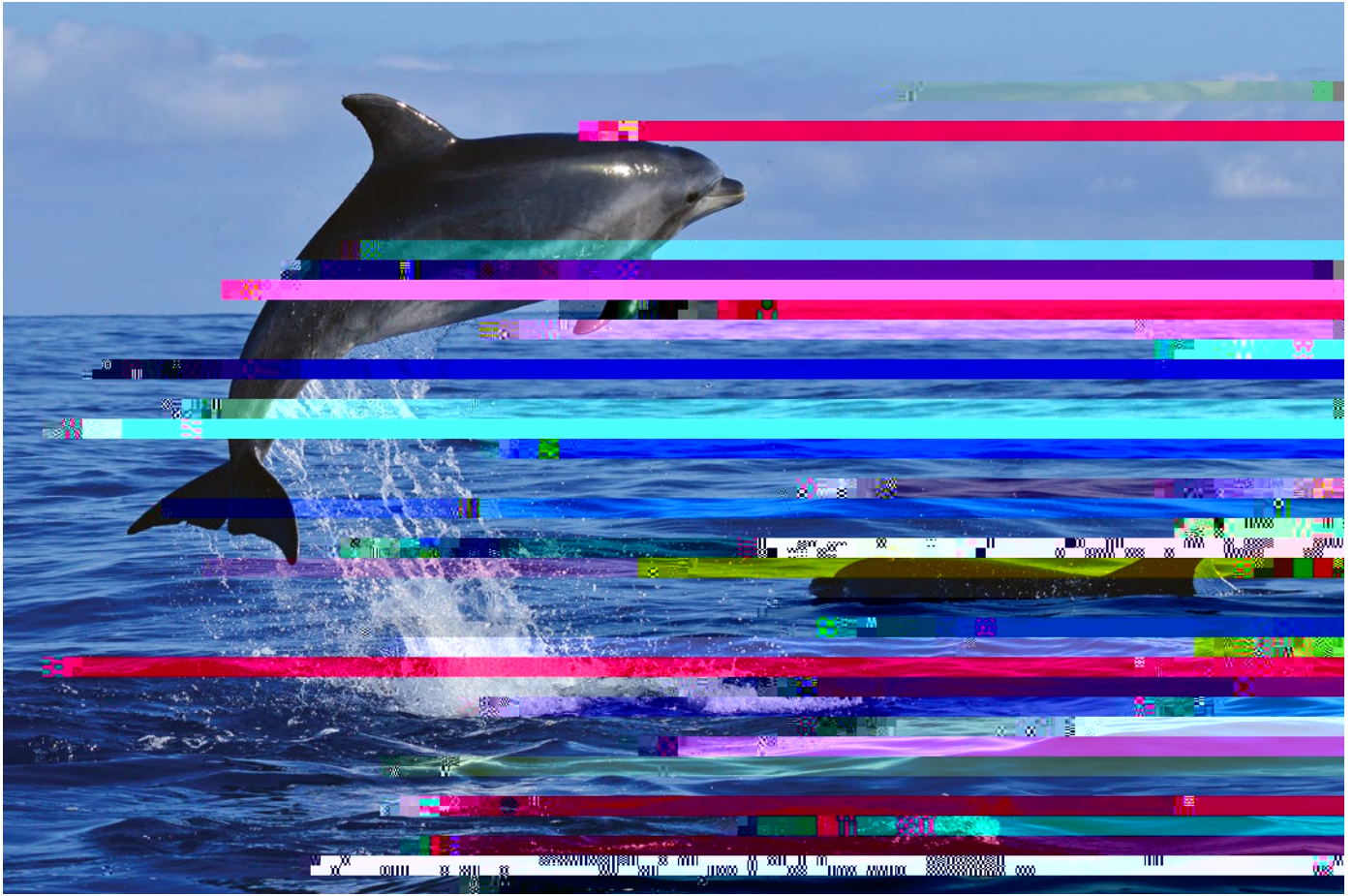
Bottlenose dolphins in Sao Miguel