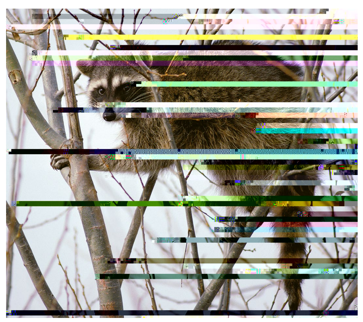
California Raccoon ( Proc on lotor psora ) climbing a tree in Lower Klamath National Wildlife Refuge

-00 L ما Small Carnivore Conservation- (KSR 5)