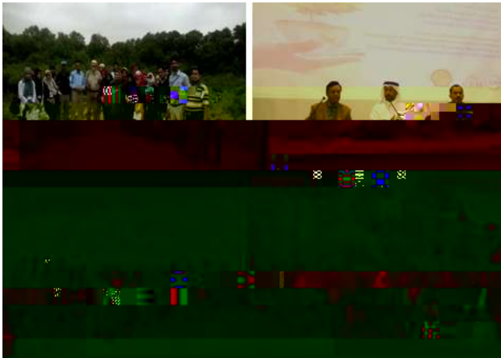
IUCN CEM Regional Activities at Karachi and Doha, Qatar.