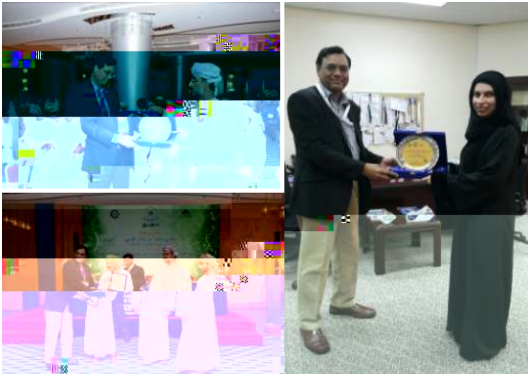
Souvenir Presentation to Minister, Dean of Science and Regional Chair CEM.