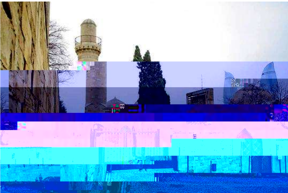
Baku Old City.