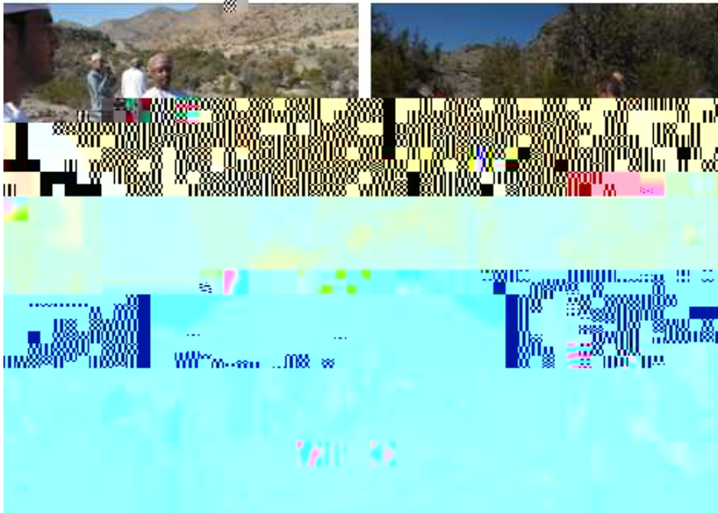
Field work during the Workshop.