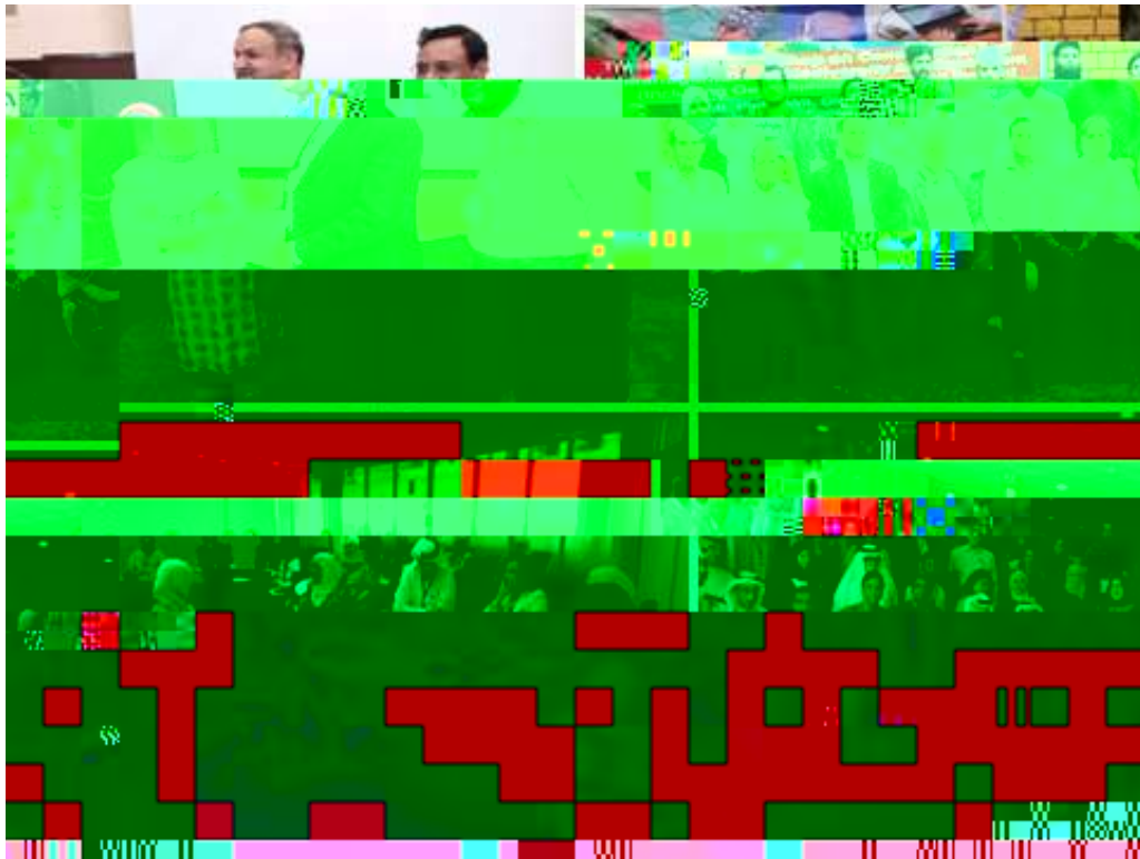
IUCN CEM Regional Activities at Karachi and Kuwait.