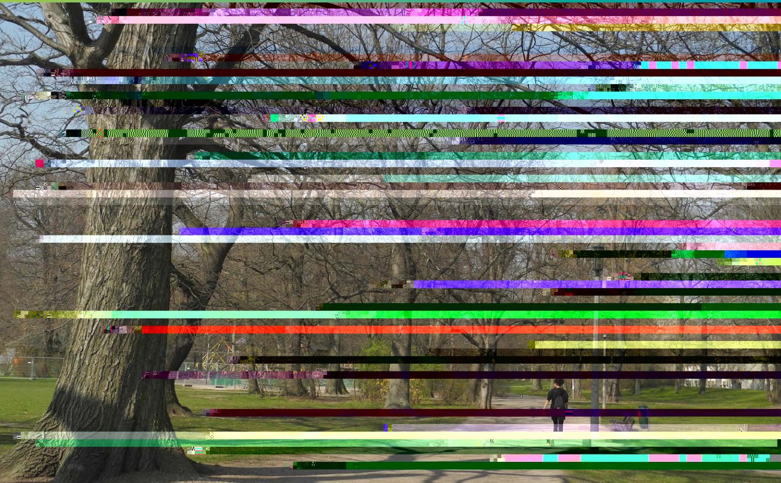
Photo: A German park during lockdown.

In planning for the long term, planners should consider the nature qualities of urban open spaces as refuges to manage future pandemics and as solutions to mitigate other global challenges, particularly climate change. The pandemic has emphasised the need to be proactive in preparing for global change, using alternative institutional arrangements, transportation systems and other factors. With a greater awareness of the importance of nature for health and wellbeing, efforts to expand and improve green and blue infrastructure for urban resilience must be renewed. Learning local lessons from this crisis, both within an administration's own city and from other cities, is key for improving resilience to future pandemics and other global changes.