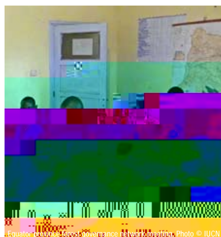
Equator province forest governance network meeting.