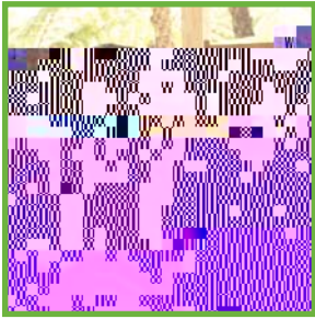
Brice Lalonde and Nigel Sizer