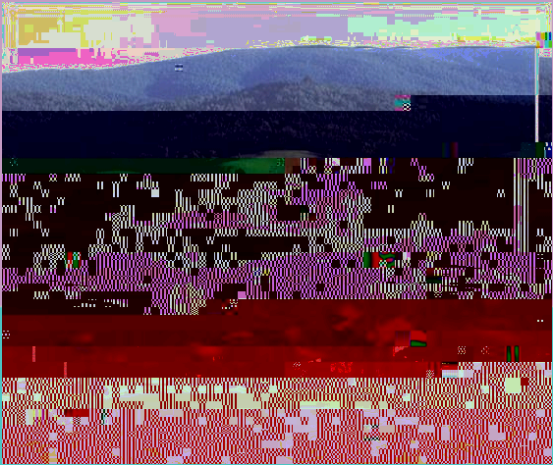
The 3200 acre campus of the Smithsonian National