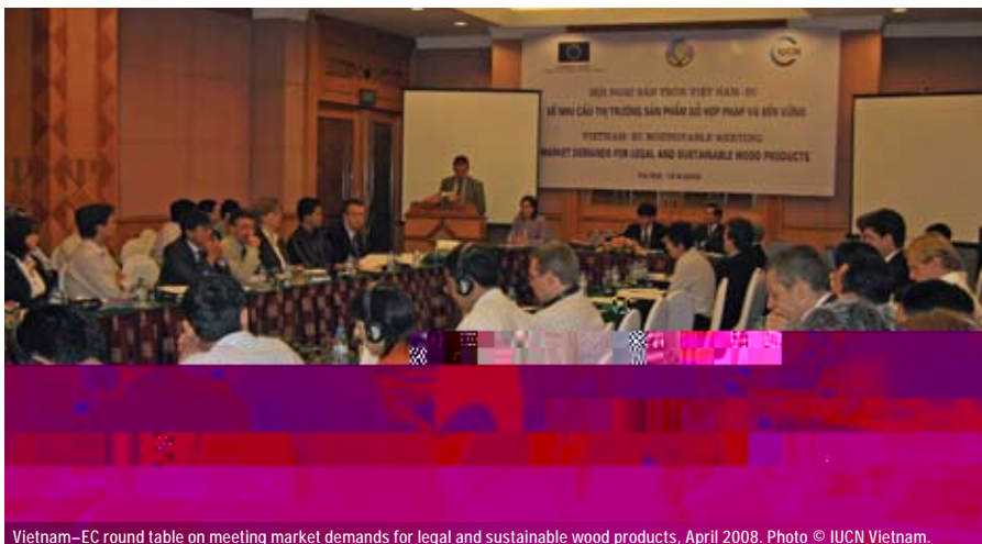
Vietnam-EC round table on meeting market demands for legal and sustainable wood products, April 2008.

Vietnam recognizes that forest resources play a vital role in its sustainable development, and is deeply concerned about the adverse impact of illegal logging and its associated trade on those resources. Since the 2001 FLEG ministerial conference in Bali, Vietnam has been taking steps to strengthen forest law enforcement and governance, both nationally